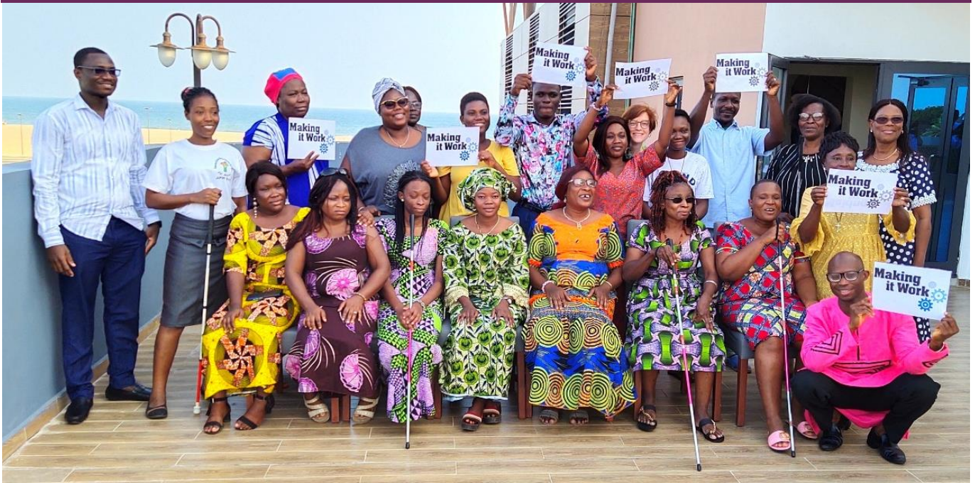
This picture was taken during our last workshop with four new partner organizations from July 4 to 7 in Cotonou, Benin. More information below!