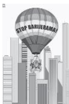
Stop Barriers Accessibility Campaign

In addition, IC Lotos succeeded in securing cantonal support for Koraci Nade from the Cantonal Ministry of Social Affairs who will cover 70% of their running costs for salaries and activities. Still, the day care centre needs to secure funding for additional costs to ensure their sustainability .